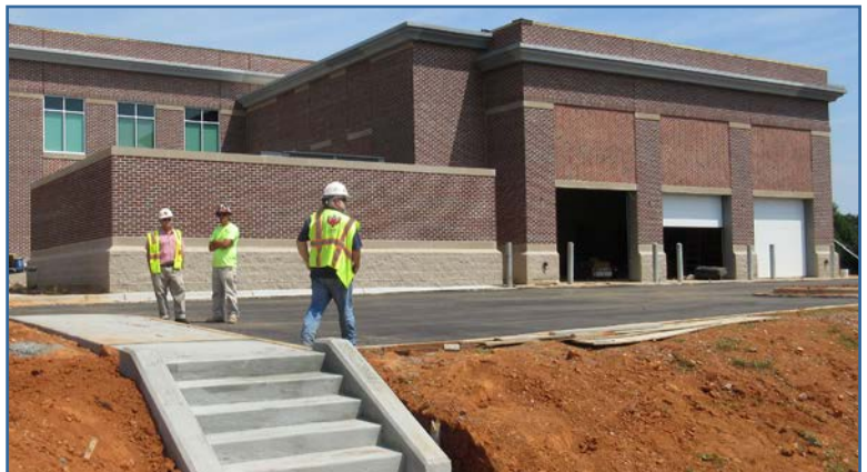
Holly Springs Law Enforcement Center

While large numbers of bidders will help to drive construction costs even lower, many of these bidders may be unqualified to bid and build your project. With the home building sector suffering as well, many "non-commercial" builders are throwing their hat in the ring on projects for which they are not qualified. One way to make sure that the builder is at least turning in a qualified, dependable bid, is to require a bid bond.